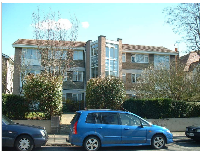
These flats opposite the Campion site are on a modest scale and are no higher than the adjacent houses.

Try Homes has appealed to the Government's Planning Inspectorate against the Council for not ruling on its application within 13 weeks. The final decision will therefore be made by the Inspectorate. When the SDC meets on 11 th December it will agree how it would have ruled had there been no appeal. That will be the basis of its case to the Inspectorate. We hope that the SDC follows the lead of the area committee and agrees on robust grounds for refusing the application.