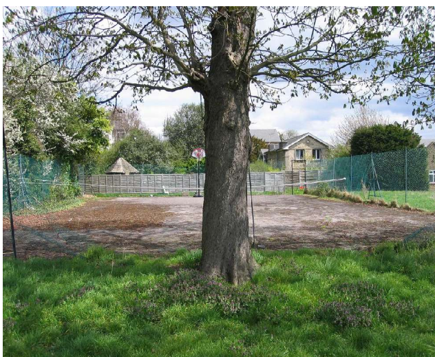
Run down, certainly – but a tennis court nevertheless

The Planning Department hesitated before giving this assurance. They told us that they did not have evidence for the use of the pitch. We have now managed to produce that evidence from schools that had used it. That seems to have clinched the matter. The day after we sent a copy of a letter from one of the schools to the Planning Department and to Sport England the Planning Department gave the assurance that Sport England had been seeking.